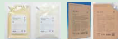
Pressure sensitive labels on pouches Postable package for e-commerce products