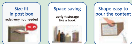
Benefits of postable package for e-commerce products.

Recyclable pouches made of a mono-material film and easy-to-remove PSLs were launched for e-commerce by Kimura Soap Co., Ltd. A three-party collaboration between Kimura Soap Industry Co., Ltd., G-Place Corporation, and FSG is taking place to conduct a trial run on the feasibility of recovering the pouches after consumer use and using them for horizontal recycling. In addition, these products are sent to consumers in postable package for e-commerce products that can be sent through mailboxes, contributing to the reduction of greenhouse gas emissions (GHG) by eliminating the need for redistribution.